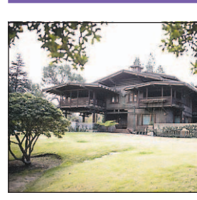
ARTS AND CRAFTS Gamble House turns 50 as public museum Home+Garden

$1.50 FACEBOOK.COM/DAILYBULLETIN TWITTER.COM/IVDAILYBULLETIN